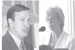
U.S. Rep. Chris Murphy and Linda McMahon