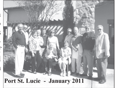
Port St. Lucie - January 2011