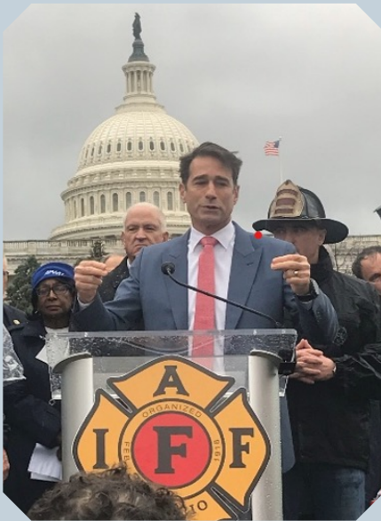
Representative Garret Graves at the last rally