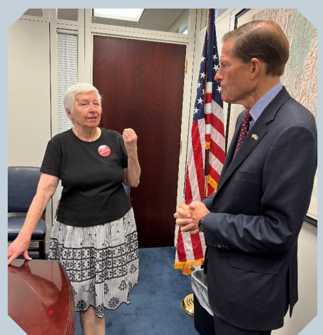
Bette with Senator Blumenthal