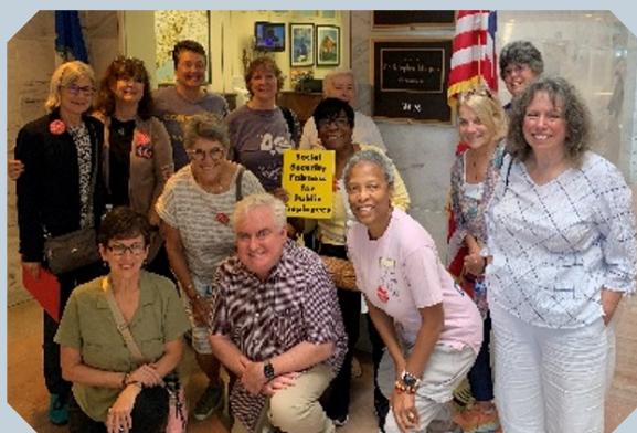
Task Force Members at Senator Murphy's office