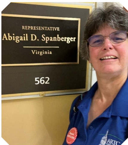
Thank you Representative Spanberger

Early WEP/GPO Pioneers-Many Thanks! The list of folks who helped in this victory is, without question, numerous and extends across the nation!