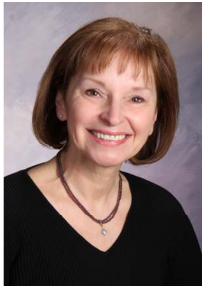
The Power of a Woman

Raffle items courtesy of ARTC Affiliates! Raffle tickets - 3 for $5.00 / 10 for $10.00 / 25 for $20.00