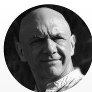
Bernie Siegel, MD Keynote Speaker